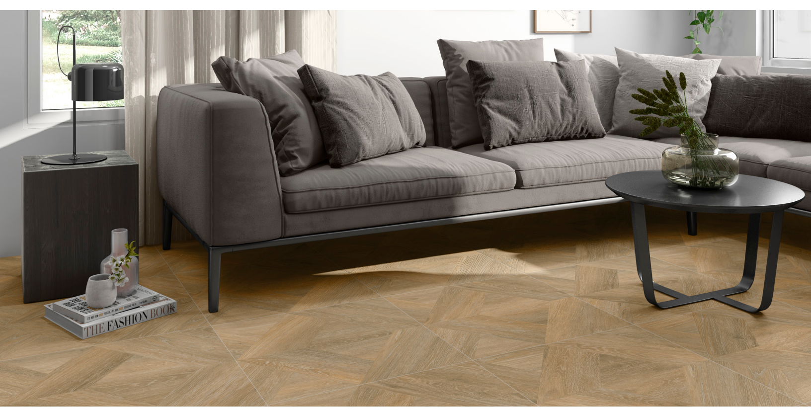
Ancona 2.0 Maple Parquet