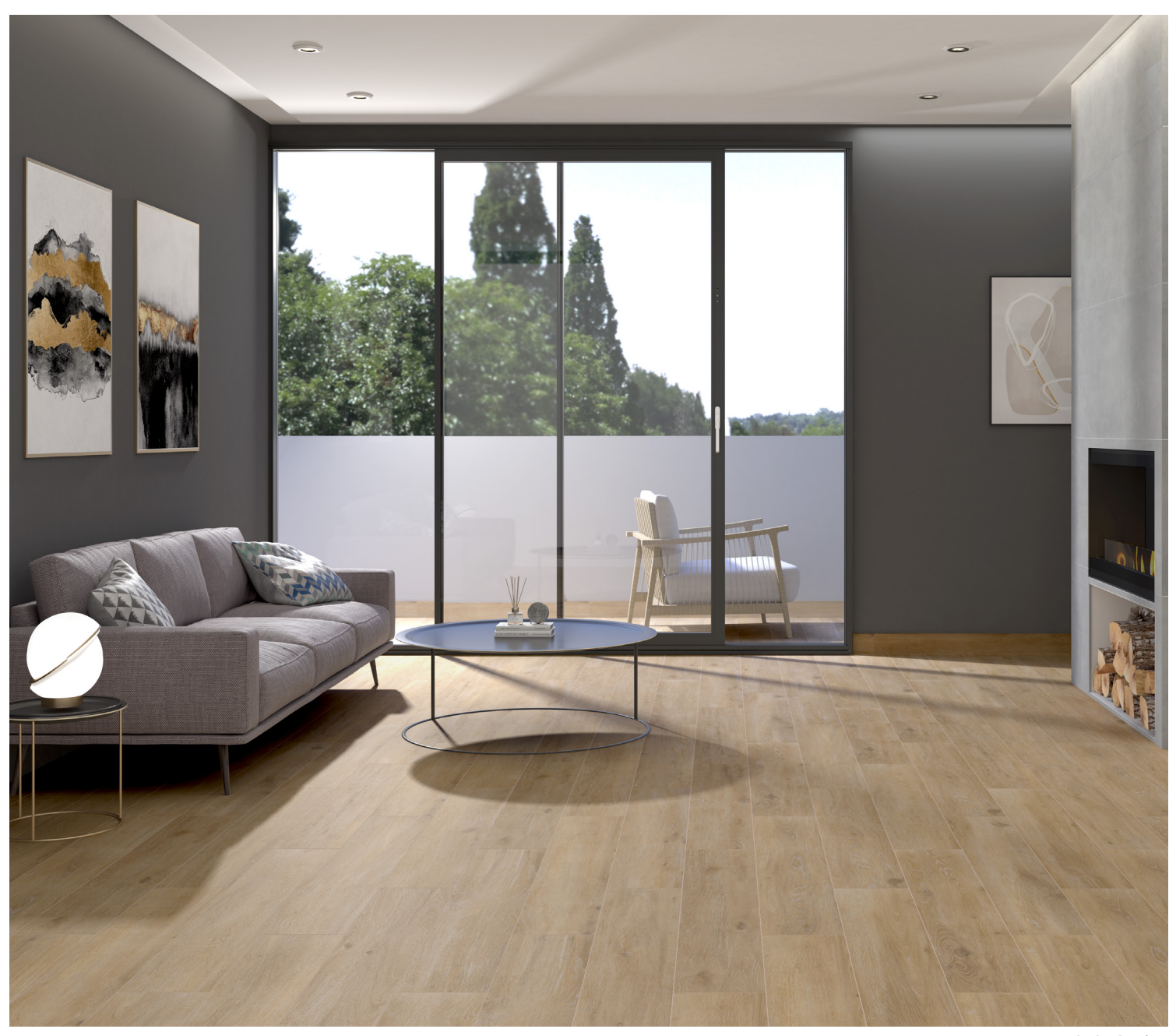
Ancona 2.0 Oak