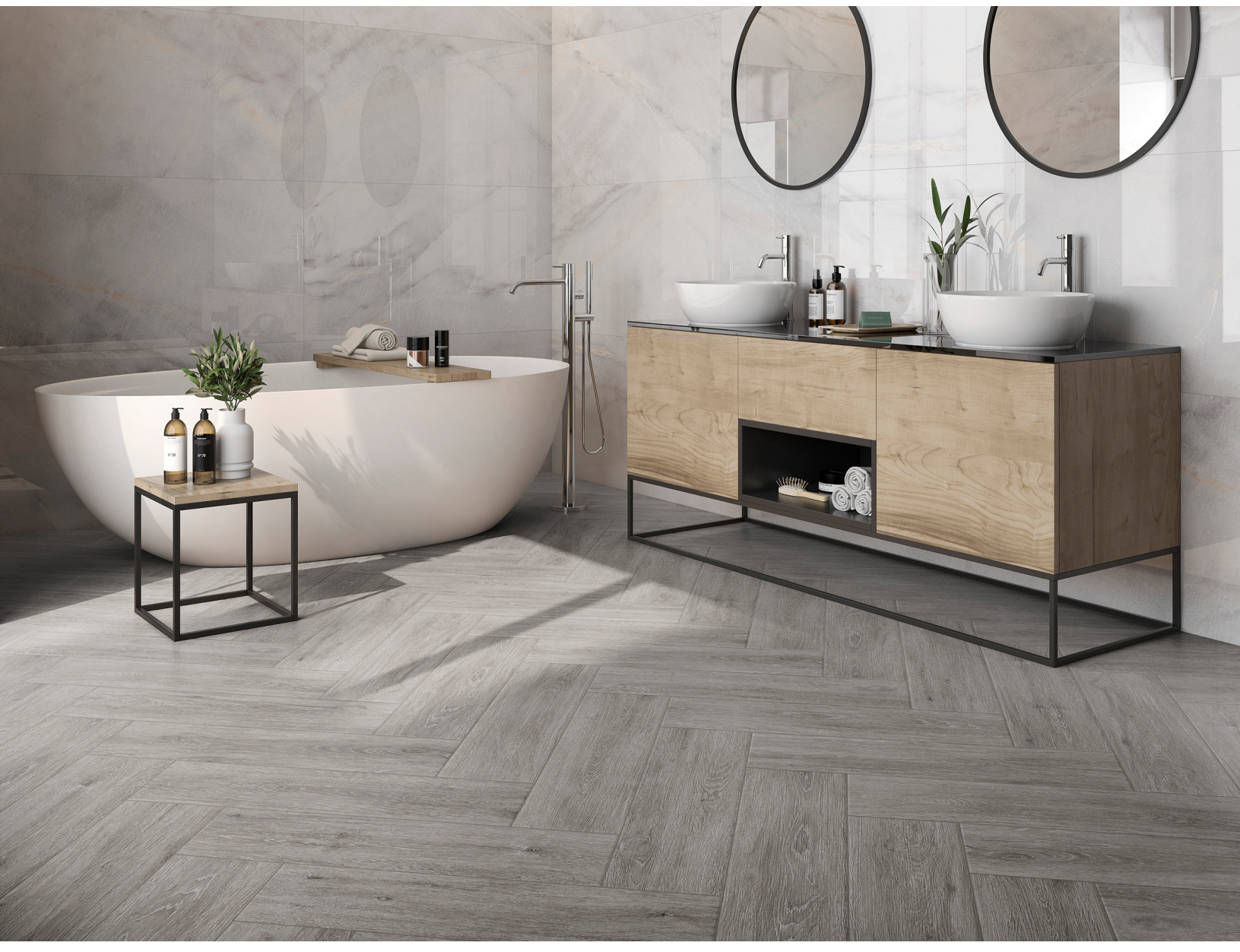
Ancona 2.0 Grey